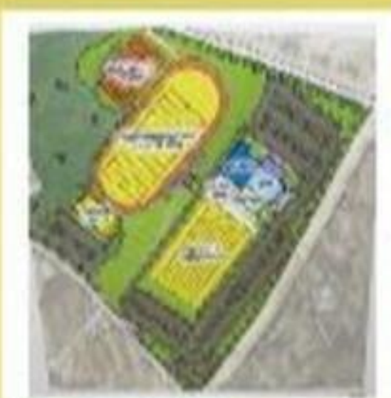
Seneca Recreation Expansion