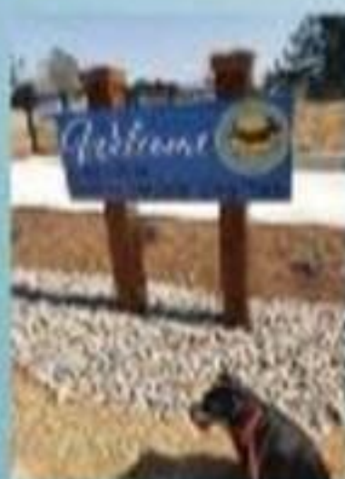
City of Seneca Petsafe Dog Park Maintenance