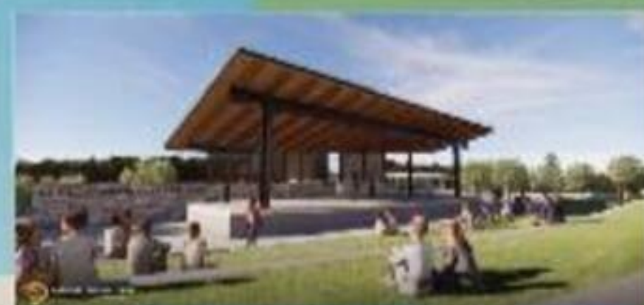
Seneca Amphitheater Early 2026