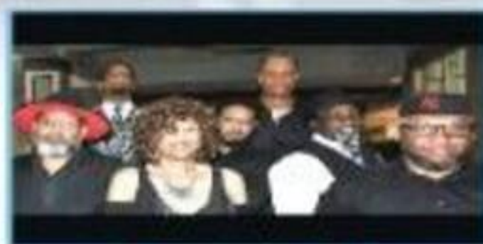
September 11 The Odyssey Band