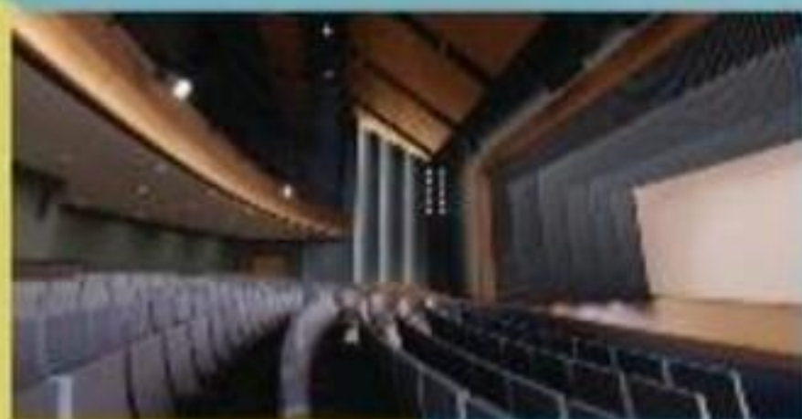
Seneca Center for the Arts Late 2026