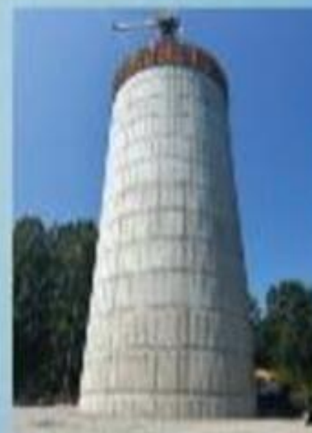
Hwy 130 Elevated Water Tank