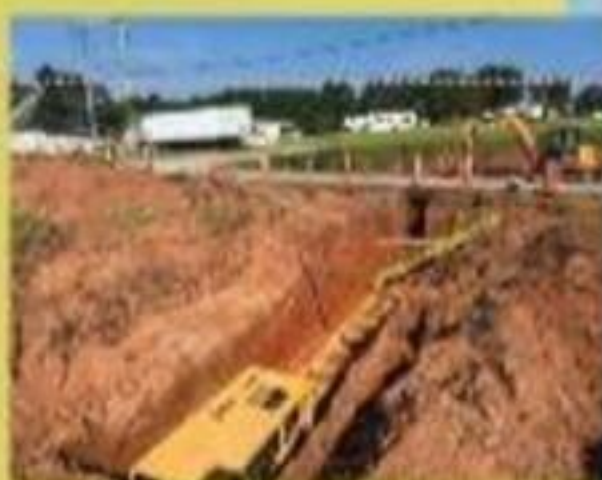
Hwy 130 New Water Line