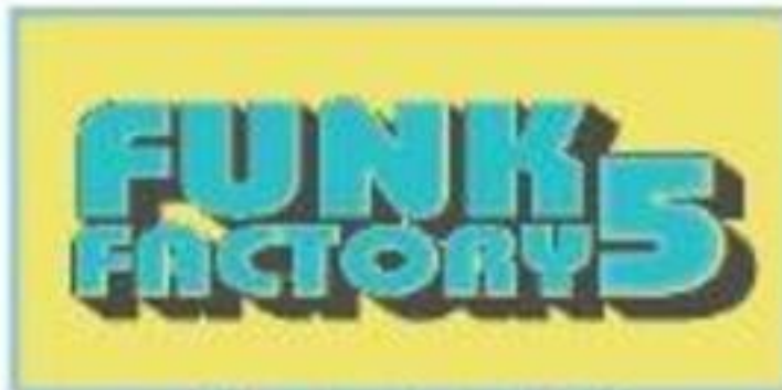
September 25 Funk Factory 5