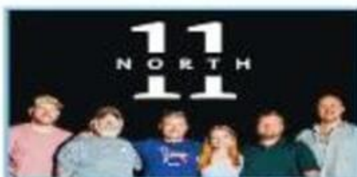
September 18 11 North