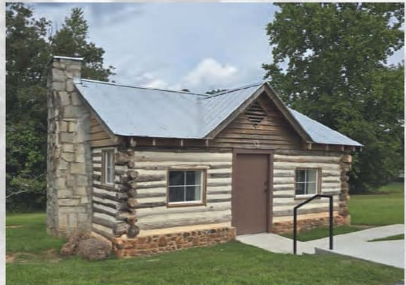
Restored Oberlin Faith Cabin Library, September 2025