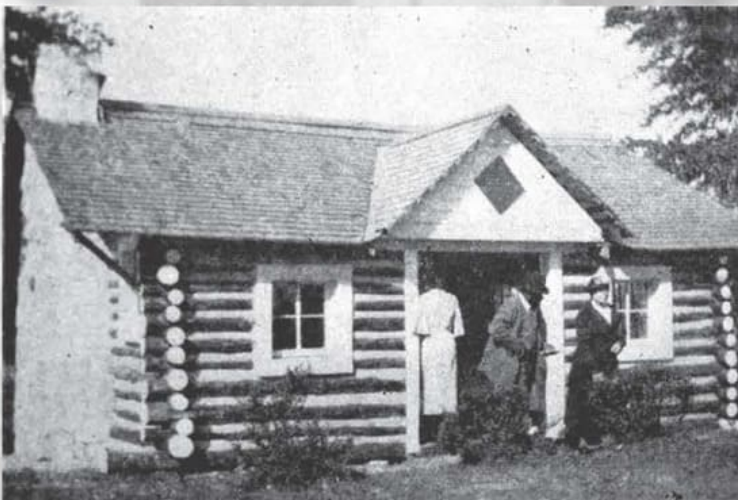
Early photo of Oberlin Faith Cabin Library, Date Unknown