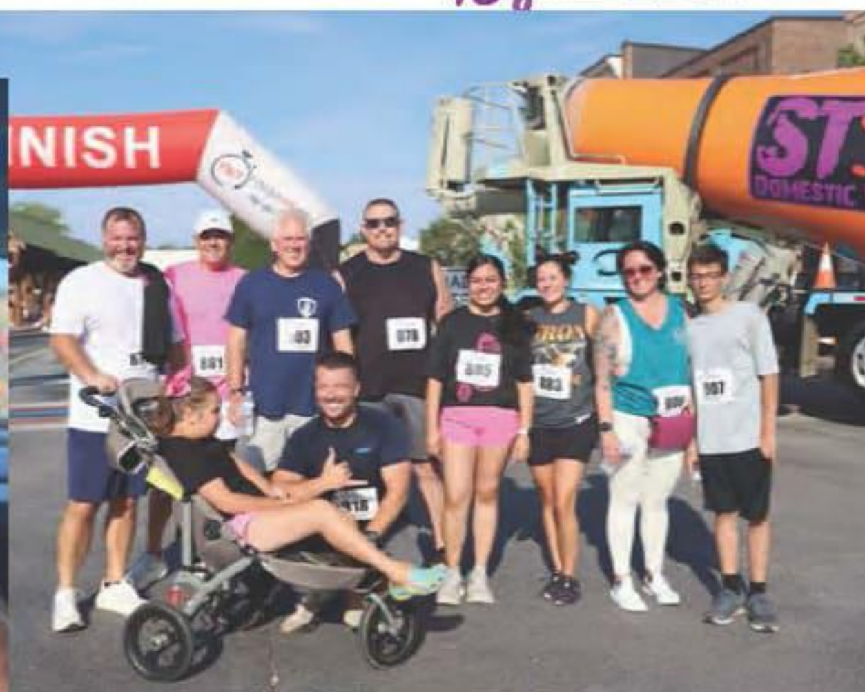
City of Seneca Team brings home the gold! Fastest Team!