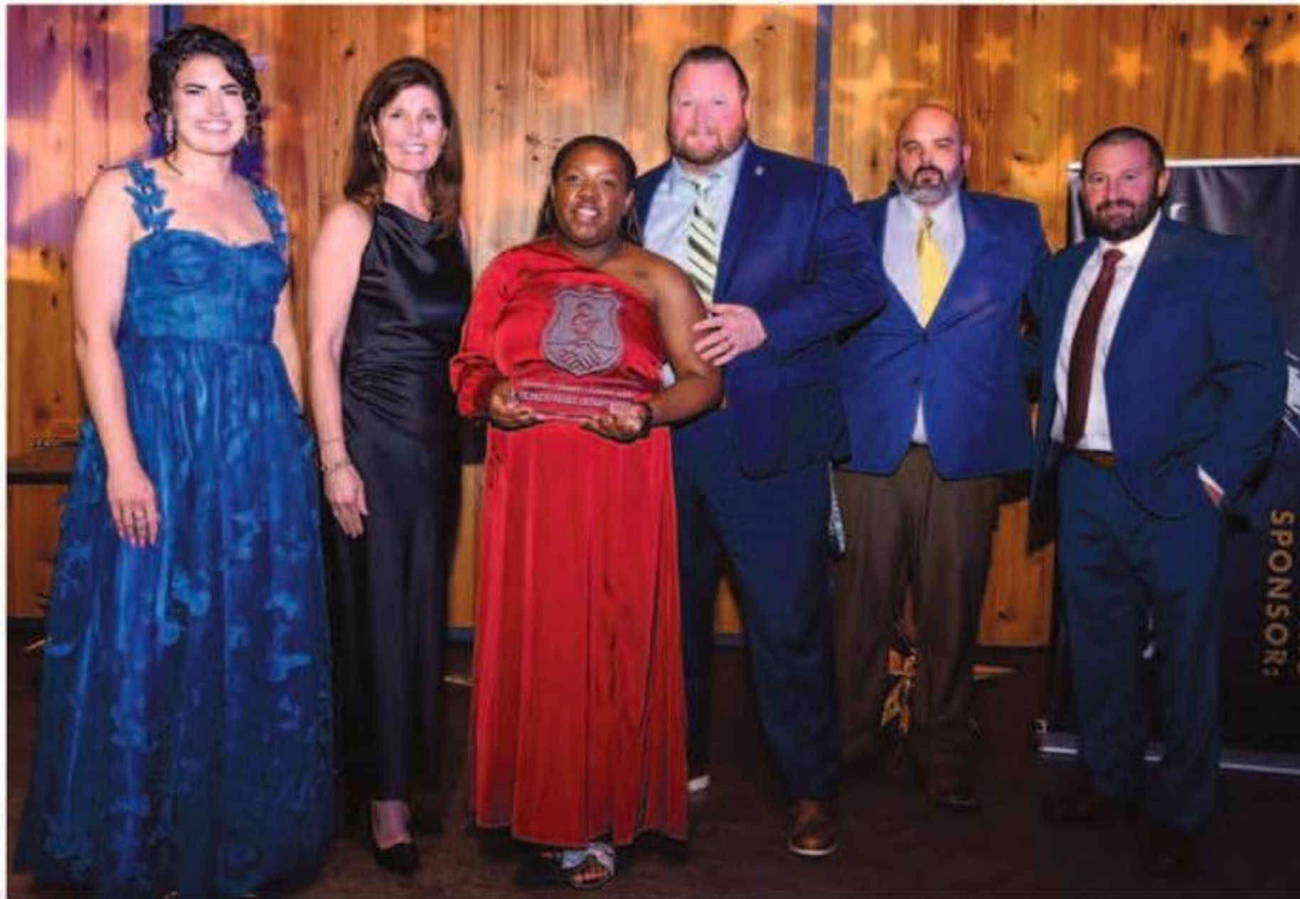
Accepting the award on behalf of the Seneca Police Department