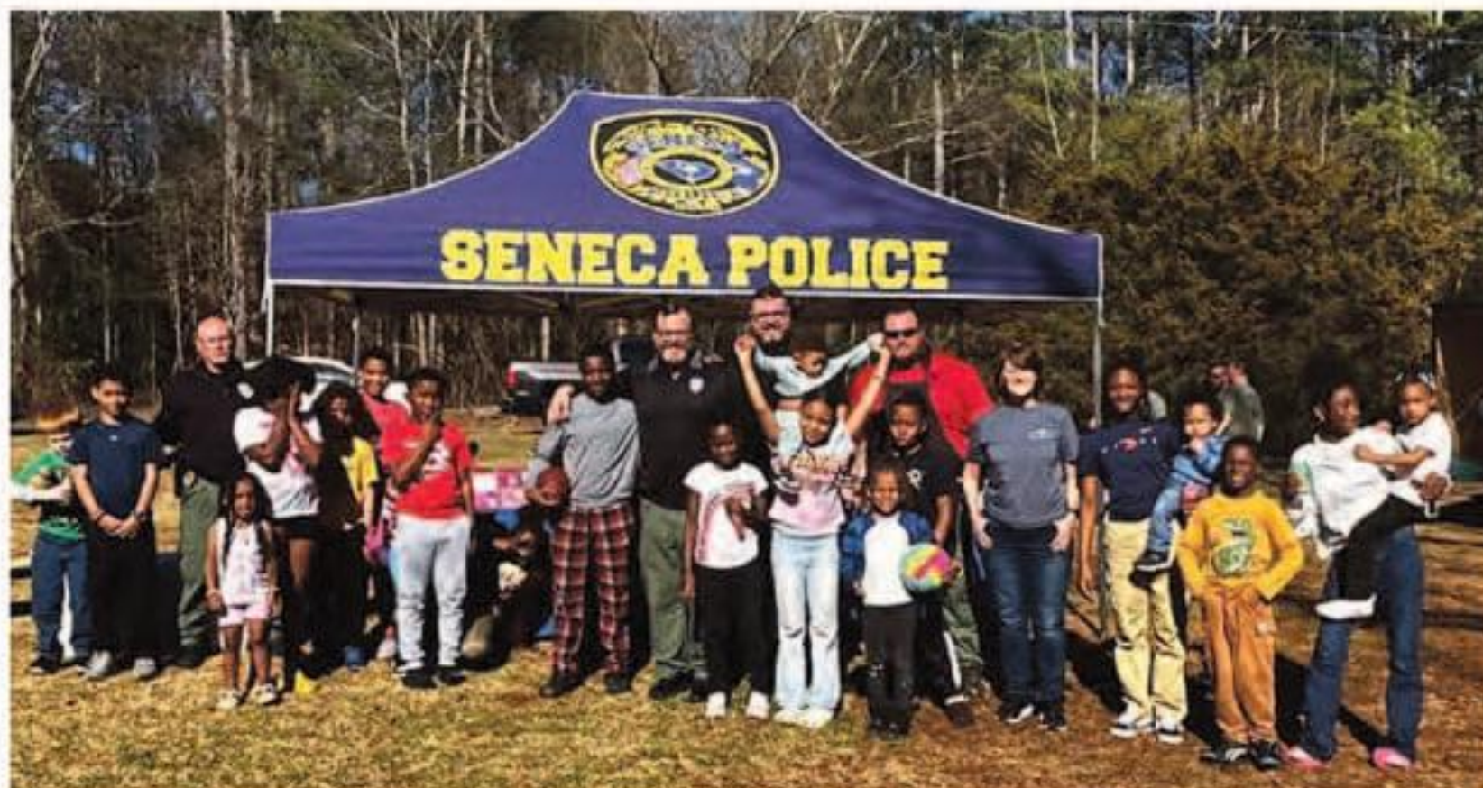
Below R&L: Seneca PD's most recent Block Party