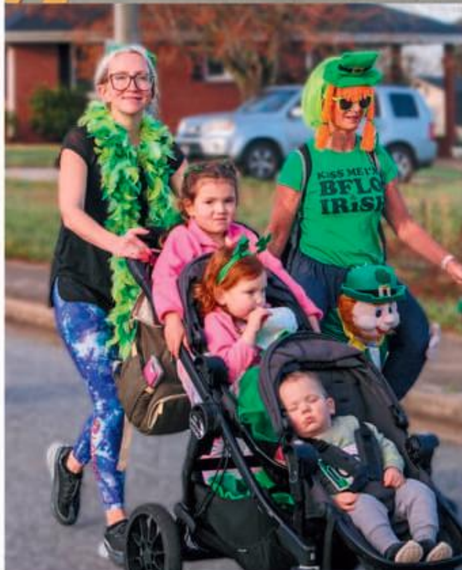
Future 5K Runner.