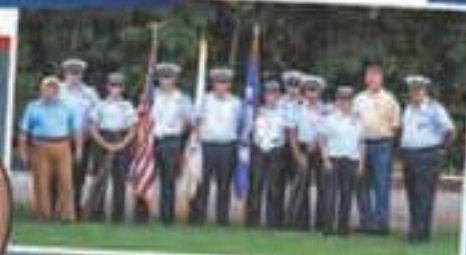
Special Guest US COAST GUARD CHOIR Singing National Anthem • 8pm

FESTIVITIES START @ 2PM ON TUESDAY, JULY 4