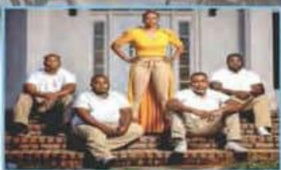
May 11 Xperience Soul