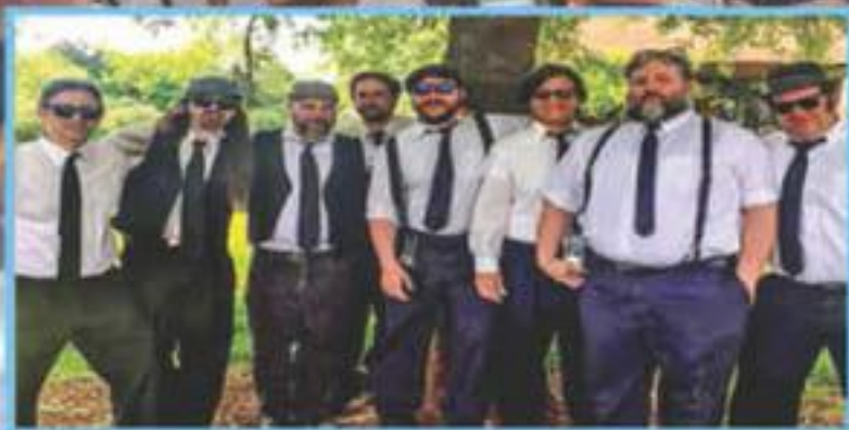
June 1 The Wobblers

EVERY THURSDAY THROUGH OCTOBER 7-9 PM • RAM CAT ALLEY Featuring: Americas Touring Musicians