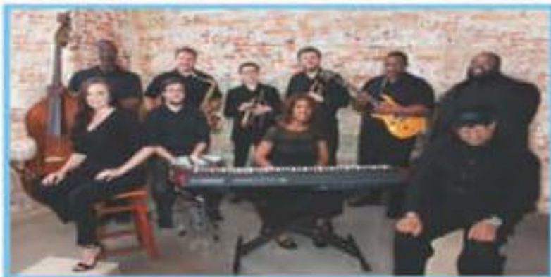
June 29 SONG