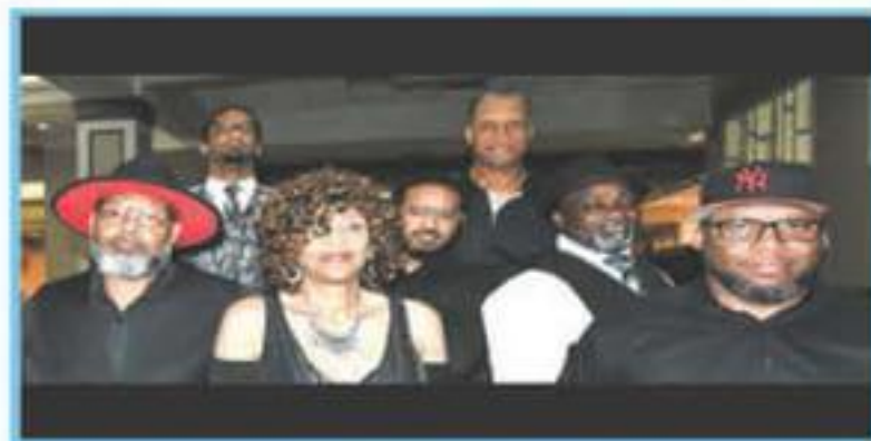
June 22 The Odyssey Band