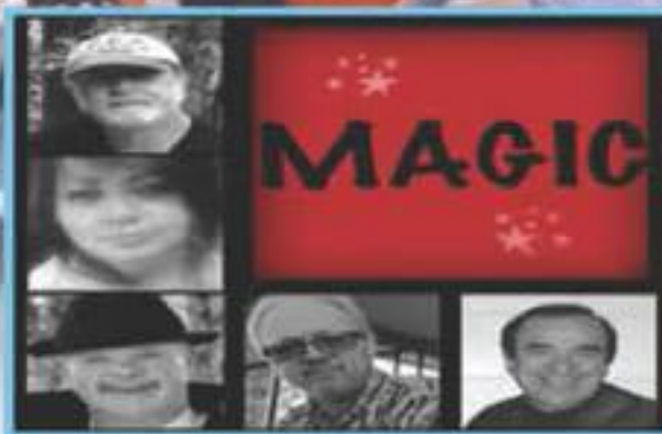
June 8 MAGIC