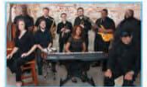
Aug 24 SONG