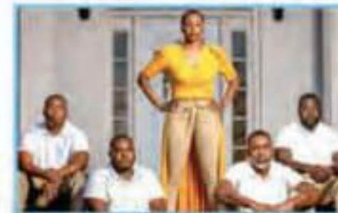
Aug 17 Xperience Soul