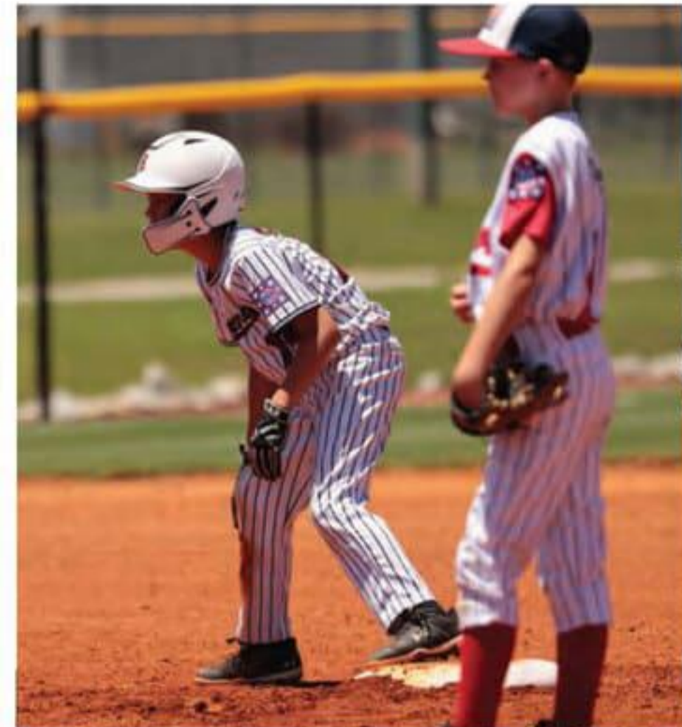
Pee Dee Team - We are the Champions!