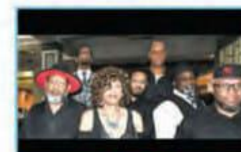
Aug 31 The Odyssey Band