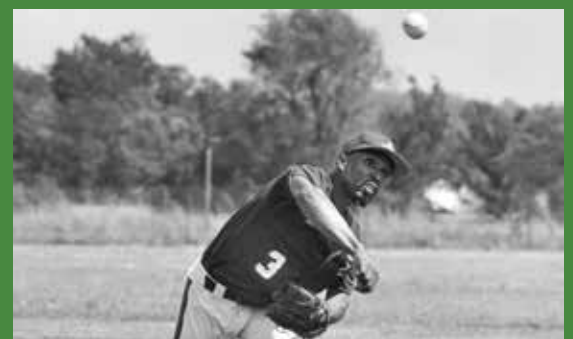
Exhibit provided through partnership with the SC State Museum and funds provided by Hospitality Accommodations Tax.

For more information: www.blscm.org or 864.710.9994.