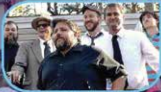
The Wobblers // July 2 //

Bring your lawn chairs and enjoy a night of music under the stars!