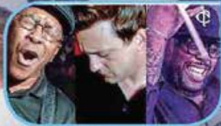
J-E-T // July 30 //