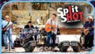
Split Shot // July 9 //