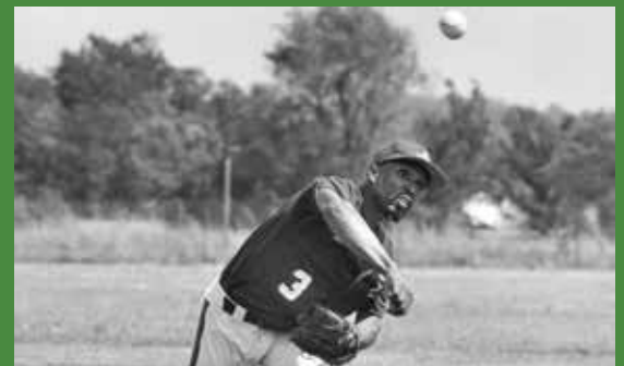
Exhibit provided through partnership with the SC State Museum and funds provided by Hospitality Accommodations Tax.

For more information: www.blscm.org or 864.710.9994.